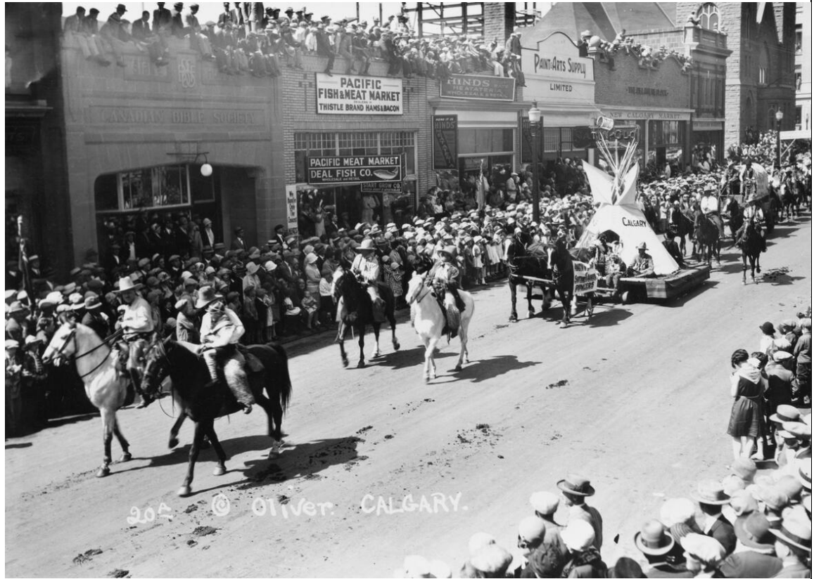
Calgary Stampede parade, Calgary, Alberta.", [ca. 1912-1939], Travelling on 7th Avenue between Centre Street and 1st Street West; passing by Wilkinson Electric (129 - 7th Avenue SW), New Calgary Market in the De La Mere Building (125 - 7th Avenue), Paint Arts Supply (123 - 7th Avenue), Hinds Meatateria (121 - 7th Avenue), Pacific Fish and Meat Market (119 - 7th Avenue), and Canadian Bible Society (117 - 7th Avenue). [ca. 1912-1939]